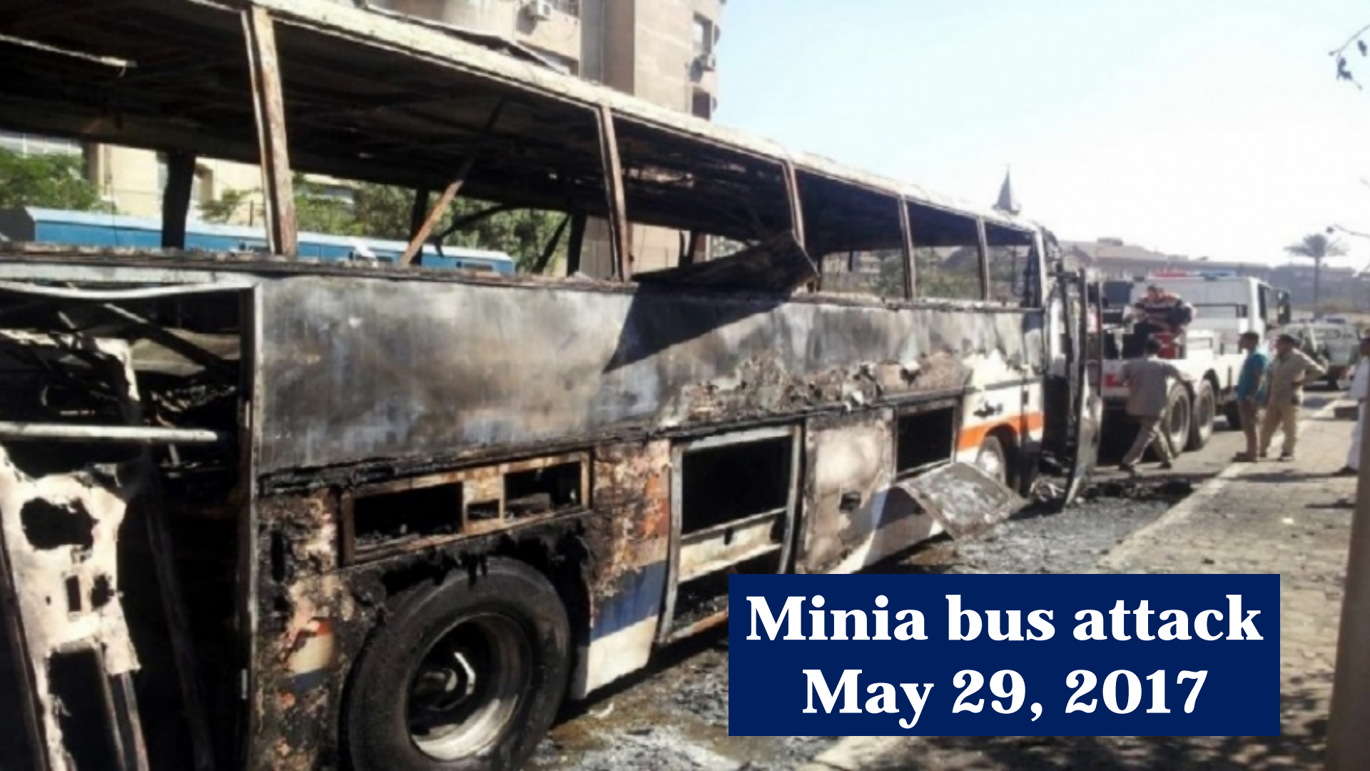
Minia bus attack May 29, 2017