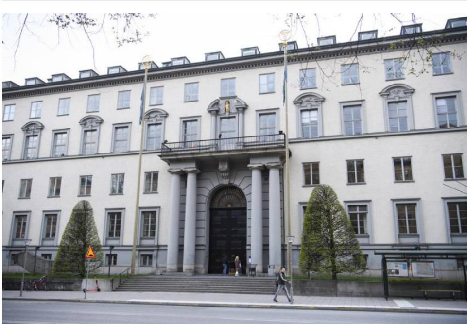
Handelshögskolan i Stockholm överväger att slopa gymnasiebetyg som urvalskriterium, till förmån för egna antagningsprov – detta på grund av allt fler så kallade "glädjebetyg", där skolors kursbetyg rimmar illa med resultaten på nationella prov.

Larmet från Handelshögskolan är en varning till hela Sverige