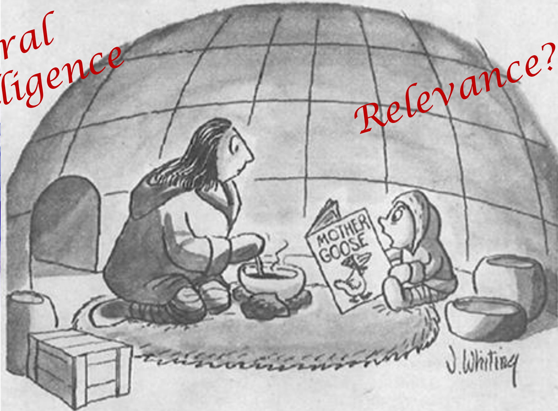
“Little Jack Horner sat in a corner, eating . . . What's a corner?”